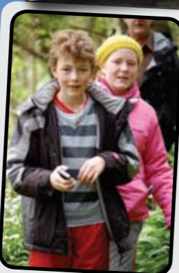
Ballyhackett PS Pupils in Downhill Demesne