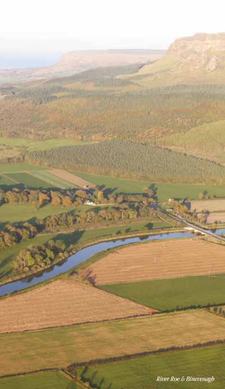
River Roe & Binevenagh