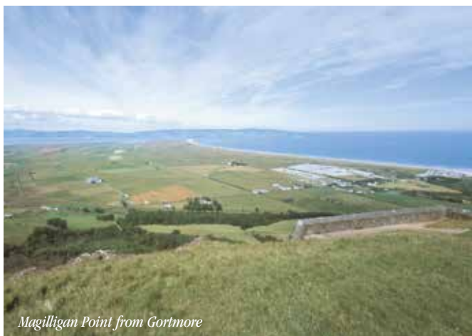
Magilligan Point from Gortmore

Most people may be aware that many birds have suffered declines in population over past decades. From common garden species such as sparrows and starlings through to the symbolic call of the corncrake now absent from our farmland. These changes have occurred for a number of reasons outlined in the 'Opportunities & threats' section (page 40) but throughout the guide those that have made the Northern Ireland Priority Species List (NIEA) have been marked with an asterisk (*). The RSPB has also identified a priority species list (more details in the 'Opportunities & Threats' section).