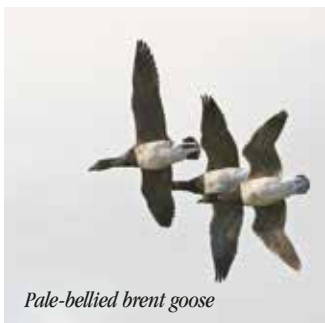
Pale-bellied brent goose