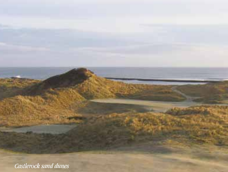
Castlerock sand dunes