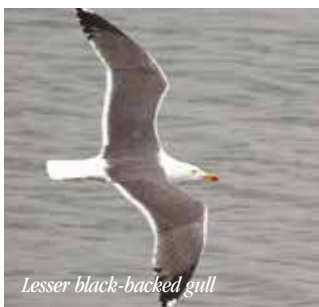
Lesser black-backed gull