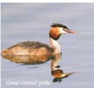
Great crested grebe

This duck has a long wispy head crest and a slender profile. Its neck is longer than most of the other ducks present in the local estuaries and it has a long serrated bill that is used for diving for fish although they also consume some invertebrates. This is a resident breeding species, using large river systems and inland lakes but is most commonly seen around estuaries and at coastal locations in winter.