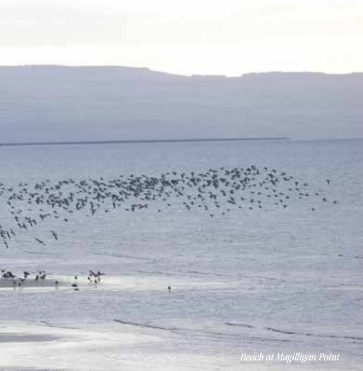
Beach at Magilligan Point

marine habitats teeming with a rich sea life, a primary food source to many popular sea faring birds.